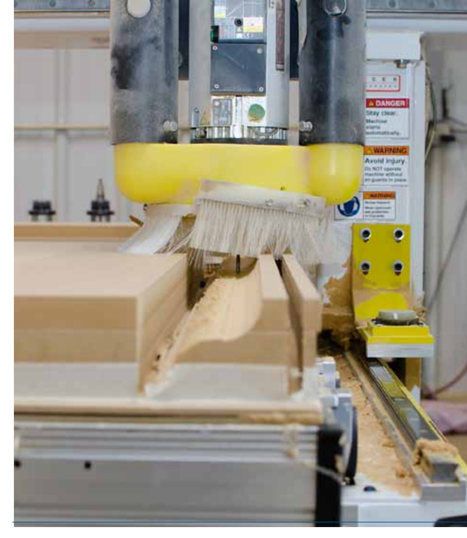
AAS Technology for Creating Customized Molds with Complex Shapes.

GFRC panels required much less support compared to cast stone or precast panels.