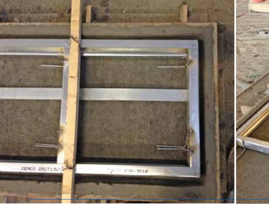
Pre-engineered panels will anchors embedded in the cast simplifies installation.