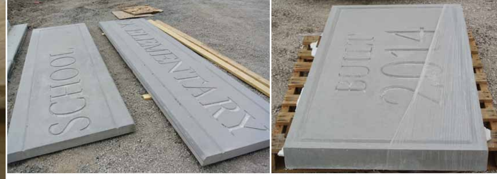
Although GFRC incorporates glass fibers within the concrete mix; it doesn't impact the visual appearance in any way. So, designer's aesthetic needs are easy to meet using GFRC.